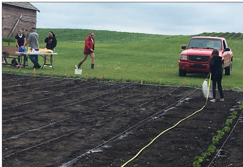
The Youth Volunteer Corps, part of Volunteer Airdrie, has provided help to the Garden of Hope, located at the Crossfield Baptist Church..