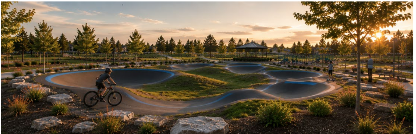
Conceptual rendering of Bike Skills & Pump Track, shown for illustrative purposes.