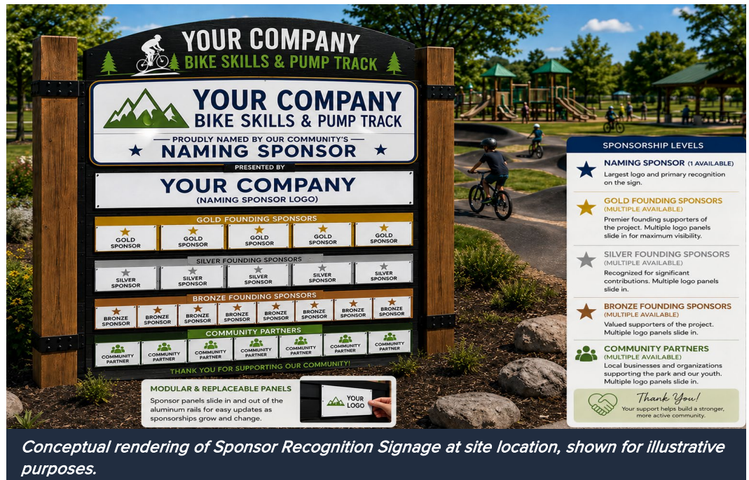
Conceptual rendering of Sponsor Recognition Signage at site location, shown for illustrative purposes.

This opportunity provides a rare chance to align your organization with a highly visible, family-oriented recreation amenity that will serve the community for years to come.